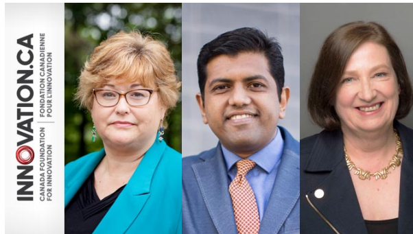
Funding to Spur Innovation /read more